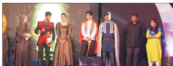
'Just a pose' competition at BMC.