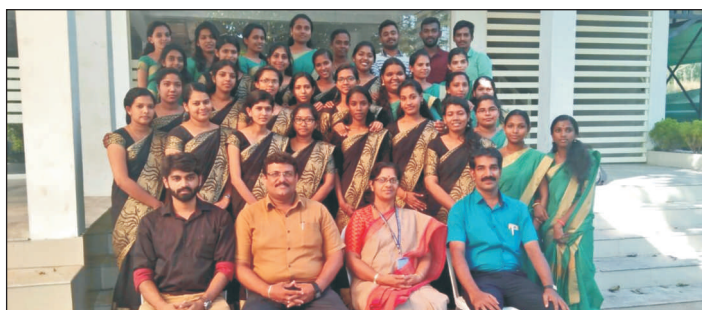
Class for M.Com Students by T.I.M.E.

The college conducts add-on courses with a view to enhance the employability of the students. The Taxation students attend GST classes and Bank Coaching is open for all batches. We also provide NET coaching for M.Com students. A course in Aviation by Speedwings Academy is also planned for the BA and BBA students.